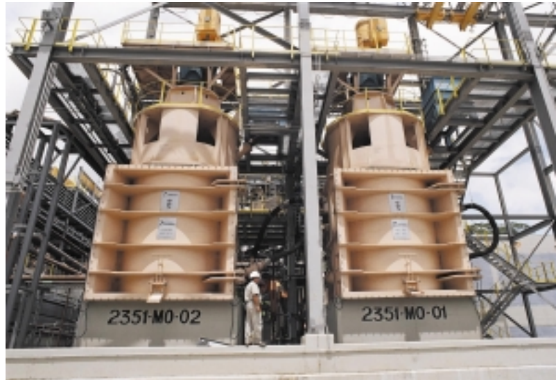
Fine grinding is an area into which Metso Minerals is putting significant research and development. This picture shows its Vertimills at a copper operation in South America

is also investigating dry processes for fine grinding, which, if successfully developed, will significantly reduce energy consumption and the cost for subsequent beneficiation processes.