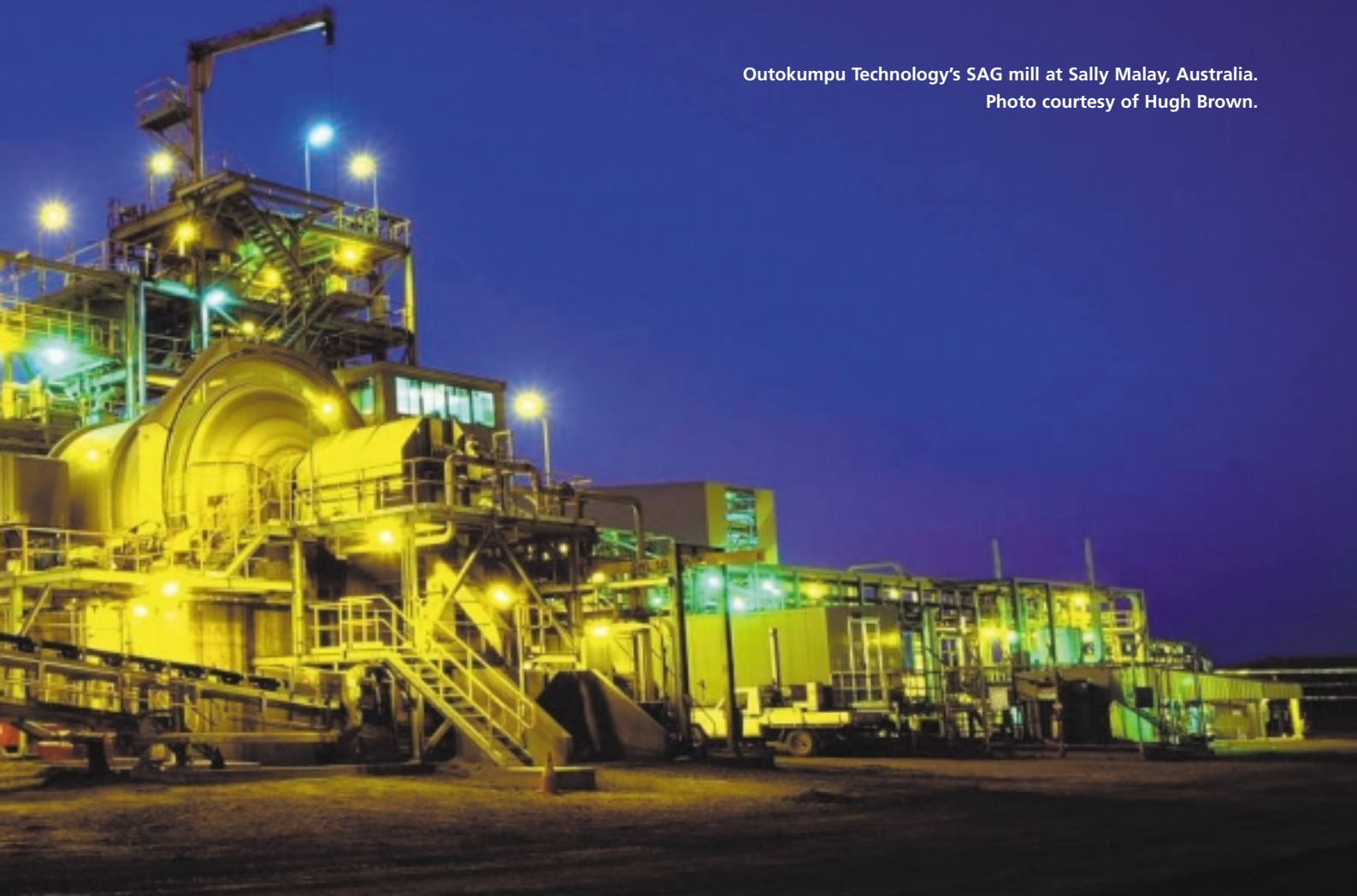
Outokumpu Technology's SAG mill at Sally Malay, Australia.