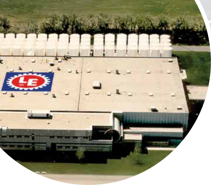
LE's state-of-the-art manufacturing facility, technology center, warehouse and primary office is located in Wichita, KS, with regional distribution out of Knoxville, TN, and Las Vegas, NV. Additional support functions are located in Fort Worth, TX. The company's international presence includes distributors in more than 60 countries.