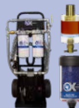
Contamination Exclusion & Removal