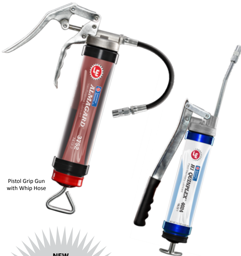
Pistol Grip Gun with Whip Hose

Reliability tool helps eliminate maintenance errors.