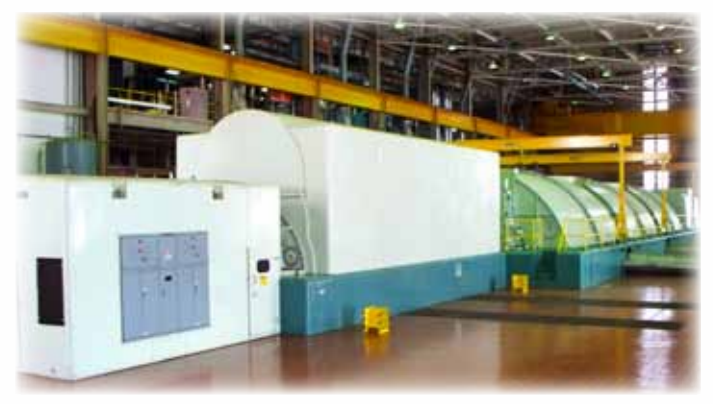
Unit 1 Steam Turbine Generator

The turbine oil in use was a traditional formula using Group I base oil, a formulation which the manufacturer announced would no longer be available. The supplier recommended conversion of all equipment to its new Group II product