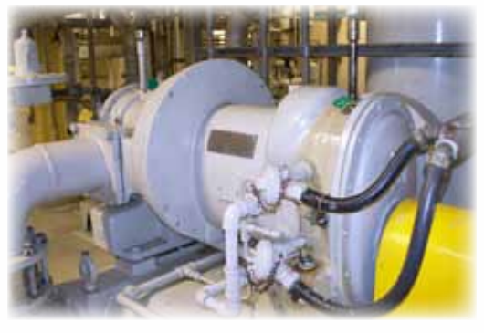
Auxiliary Vacuum Pump