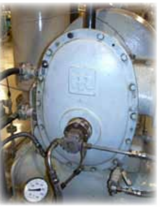
Main Vacuum Pump