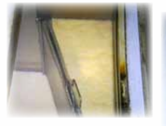
Above: Before Monolec, foam is near top.

Right: After Monolec, foam level drops by two-thirds.